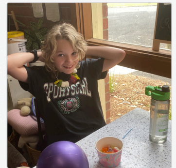
Making Edible Jewellery