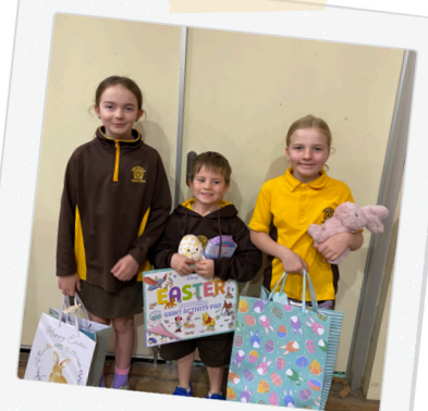
Some of our Winners